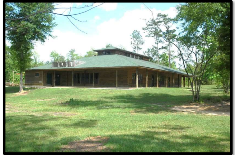
Dining Hall @ Salmen Scout Reservation

It is important for unit leaders to assist the Camp Staff by not allowing their Scouts to leave the Dining Hall until dismissed by the Dining Hall Steward. The Dining Hall Steward will dismiss the table waiters when they have completed their duties. Scout leaders are expected to spread this responsibility among all boys attending Camp. It is a suggestion that your troop's first table waiter be an experienced Scout, to demonstrate the proper methods to your Scouts. If your Scouts would like certain staff members to eat with them at morning and evening meals, they can pick up that staff members totem on the way to the Dining Hall. Scouts are required to be in Field Uniform for the evening meals.