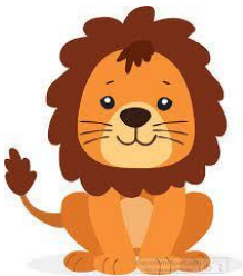
ALTERNATE LION ACTIVITY