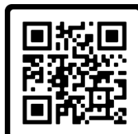
Summer Camp Wk 2

The program will be limited to no more than 10 Scouts each week. To participate, Scouts must be First Class and at least 13 years old. Scouts must pass the swim test with a "Swimmer" rating. The cost for early bird registration by March 31, 2025, will be $550 per Scout and $575 for late registration. Lodging, meals, transportation, and all program fees included.