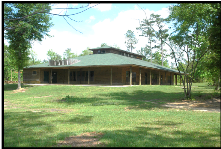
Dining Hall @ Salmen Scout Reservation

It is important for unit leaders to assist the Camp Staff by not allowing their Scouts to leave the Dining Hall until dismissed by the Dining Hall Steward. The Dining Hall Steward will dismiss the table waiters when they have completed their duties. Scout leaders are expected to spread this responsibility among all boys attending Camp. It is a suggestion that your troop's first table waiter be an experienced Scout, to demonstrate the proper methods to your Scouts. If your Scouts would like certain staff members to eat with them at morning and evening meals, they can pick up that staff members totem on the way to the Dining Hall. Scouts are required to be in Field Uniform for the evening meals.