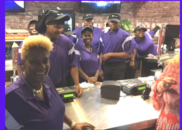
Intergenerational Guidance Group operating concessions at a Pelicans game

We guarantee a minimum donation amount of $100 per volunteer at the Superdome and $80 per volunteer at the Arena. You earn either the commission or the minimum donation, whichever amount is larger!